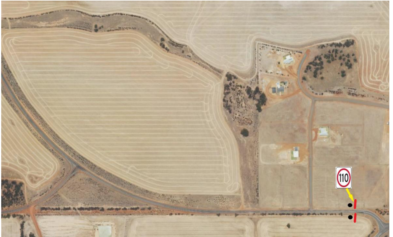
Current speed zoning