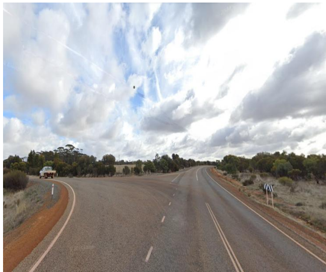
Kulin West Rd Intersection.

The housing estate has the capacity for 17 properties with 7, already occupied.