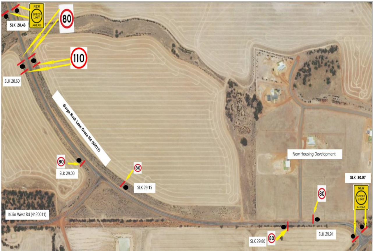
Proposed new speed zoning