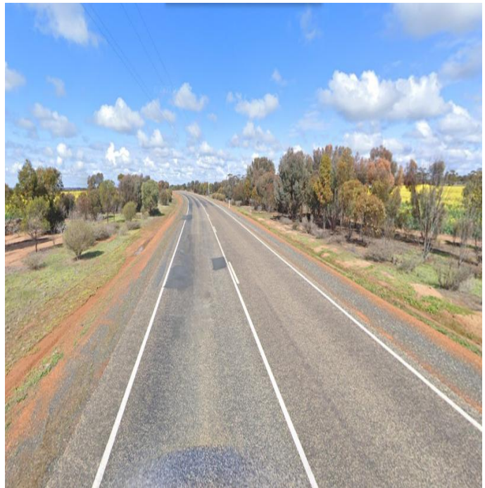
Gorge Rock lake Grace Road SLK 28.60 looking south