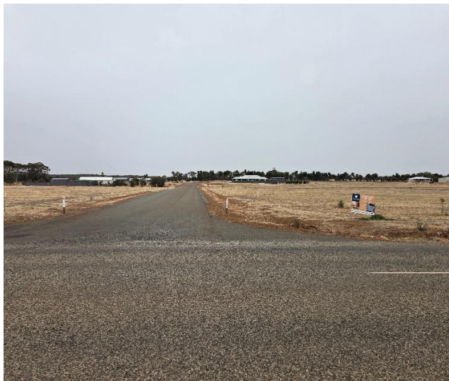
Hodgson St Intersection.

There are two intersections on the section of road under review. Kulin West Rd (4120011) which T intersects at SLK 29.07 this is a local road, and Hodgson St (4120166) SLK 29.85, this is the intersection that the new housing estate enters onto Gorge Rock Lake Grace Road M017. There is ample sight distance for both intersections with little vegetation.