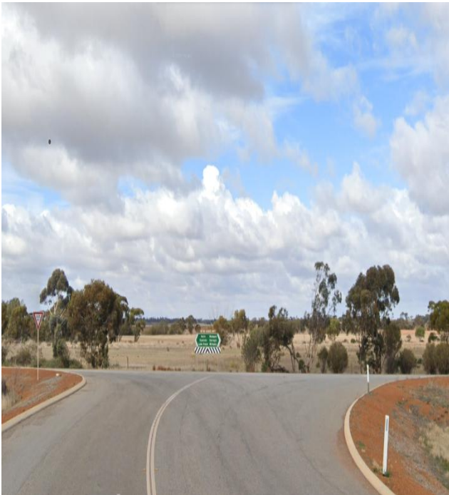
T intersection with the M038

Gorge Rock lake Grace Road is a Sate Road under the care and control of Mian Roads. extends in a north-south direction and has a bitumen seal with double barrier for the most part and edge lining. It T intersects with the M038 where it terminates.