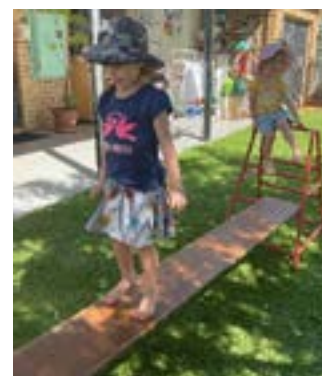
Setting up different climbing frames gives the children an opportunity to practice balance and co-ordination skills safely.

A big thank you to our families from the KCCC staff for supporting our centre.