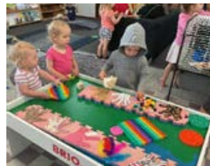
Our 'All About Me' theme continues, and we have been focusing on learning about our 5 senses: sight, hearing, taste, touch, & smell. Sue created a great sensory table to explore touch, the children have also been painting on ice to continue our learning outside.