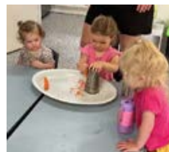
about fueling our bodies. Last week we cooked carrot muffins, the children enjoyed taking turns to grate the carrot. The children also enjoyed how the muffins tasted! The activity was great for teamwork & practising how we can take turns.