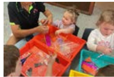
We have been practising our cutting skills at Kulin Childcare Centre this past few weeks. A great skill to learn for school readiness. The children have really enjoyed cutting different materials including rice noodles, pasta, and paper straws.