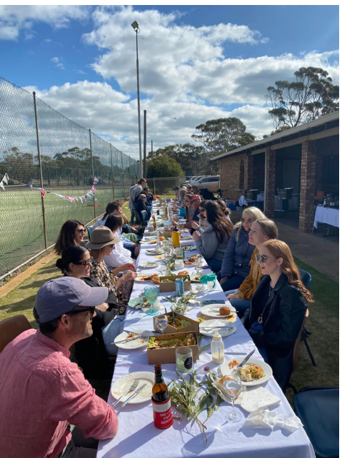
Kulin Netball Club long table lunch windup 2022.