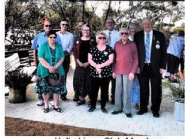
Kulin Lions Club Members