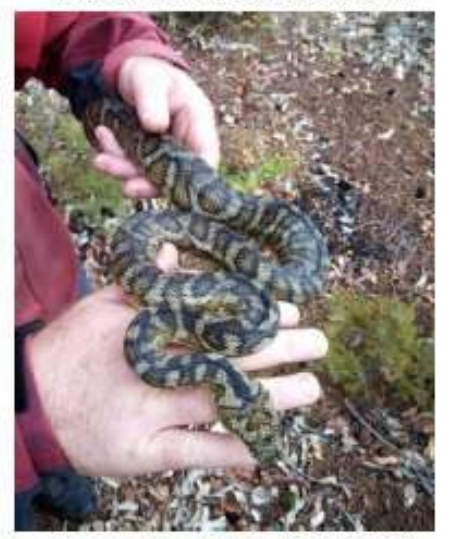
Carpet python.