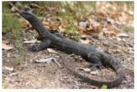
Heath monitor.

Refer to www.naturemap.dpaw.wa.gov.au to find further information on these species' distributions.