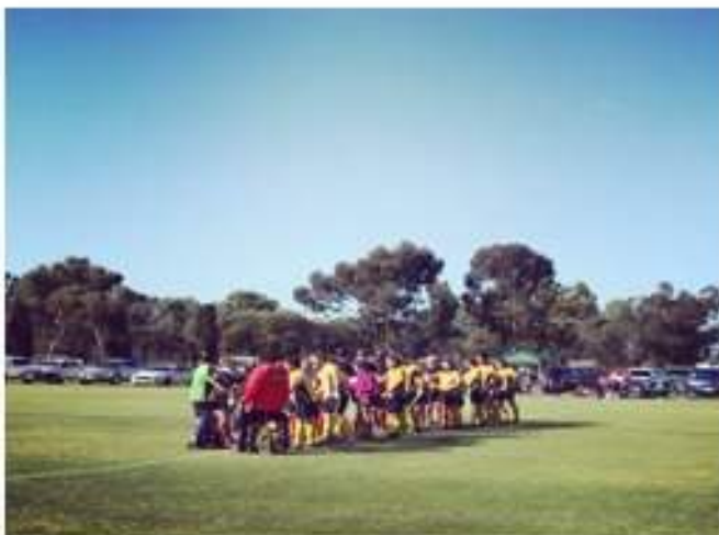
Our Men lining up against Corrigin for a stellar match.

This Saturday are the Grand Finals in Kulin. Come on down for a great day of hockey!