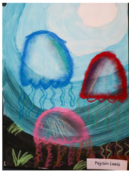
Peyton Lewis, 'Under the sea'