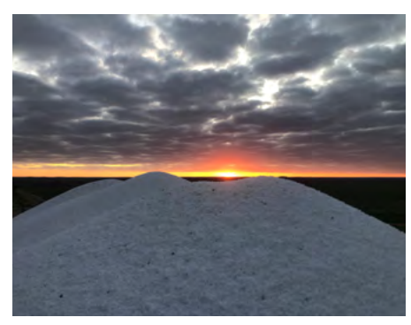
'The sun rising over the snowy lime pile' by Rob Doust