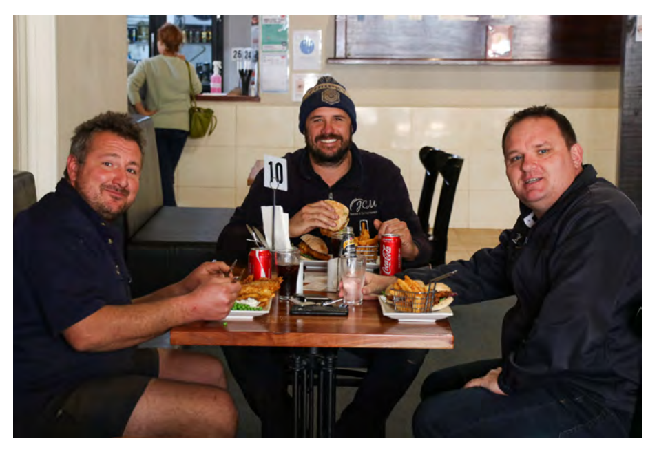
The Kulin Community Hub is also enjoying the latest restrictions of COVID being lifted.

Sundays ago. The FRC is also back up and running, as an alternative watering hole over the weekend and for designated community events.