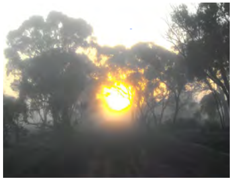
'Sunrise up Johnston Street, Kulin'