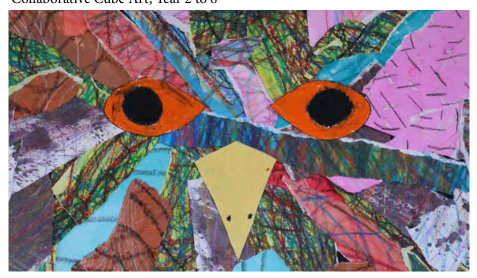
Cadel Bowey. 'Expressions of an animal'