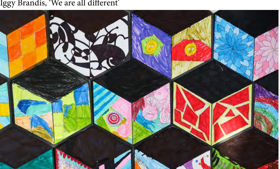
'Collaborative Cube Art', Year 2 to 8