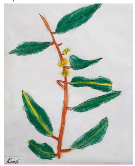
Kensi, 'Eucalyptus Sketch'