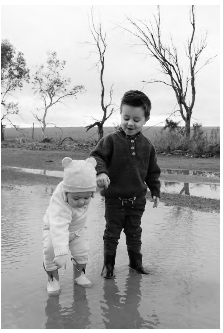
'Puddle Happiness' by Ashlee West