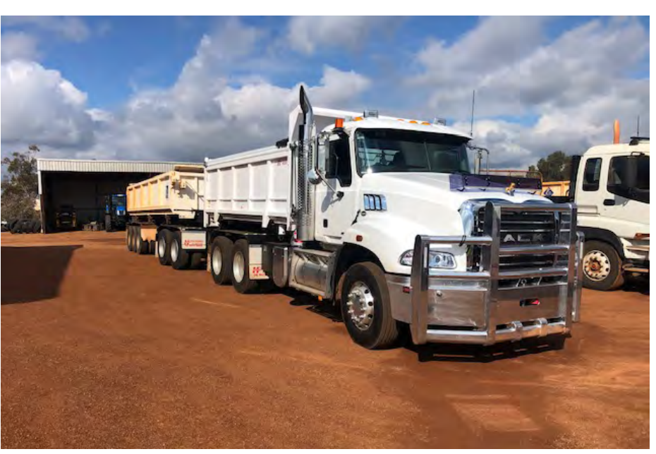
The Council's latest piece of equipment: a new Mack 6 wheeler side and end tipper capable of towing a 5 axle dog trailer.

The Kulin Community Hub is also enjoying the latest restrictions of COVID being lifted. I've personally enjoyed a couple of samples of their new menu. They've even found some fame on ABC TV a couple of